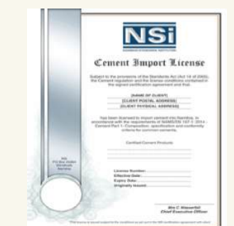
Cement Import License