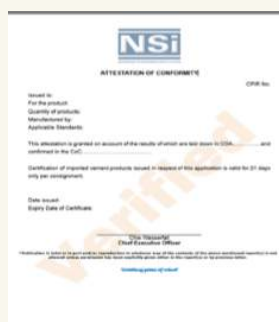
Attestation of conformity

(e) Cement granted entry into the Republic of Namibia.